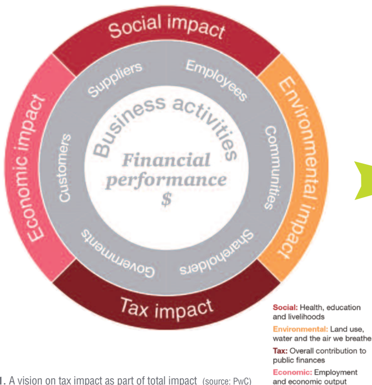
Figure 1. A vision on tax impact as part of total impact

As Mervyn King, the world's most famous advocate of integrated reporting, stated: "... the world's iconic companies have realized that the impacts of their activities on their stakeholders and generally on society, the environment and the economy, are critical... Integrated thinking requires all these [complex] factors to be considered in a holistic manner, so that the company can understand, and make decisions based on the overall impact it has on all its stakeholders. Total impact measurement and management is a new language to assist companies in understanding the overall impact of their activities... and to assist them in moving towards integrated reporting." 31