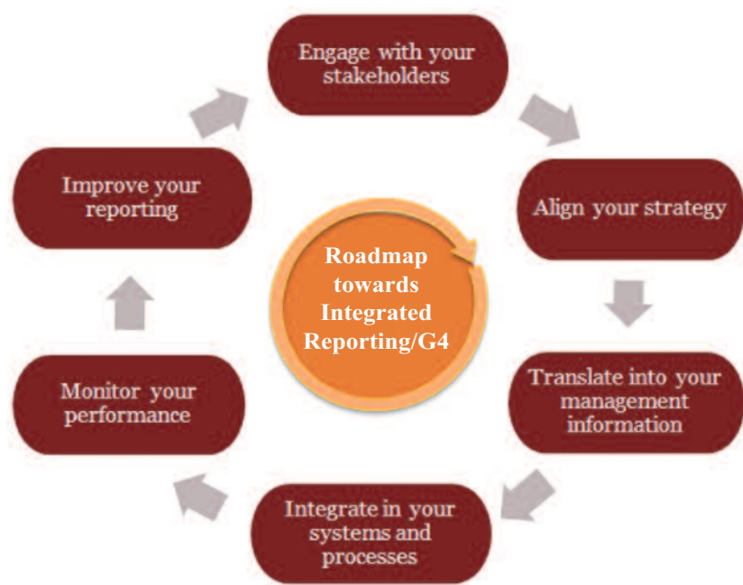
Figure 3. The continuous learning cycle towards good tax governance, step-by-step and focusing on material aspects

What will we learn from following this learning cycle? We do not yet know how we can develop a new common business language from this learning cycle. Yet, working along this learning curve will result in developing that new common business language. In connection with this we refer to the Barley Case in appendix 1 33 .